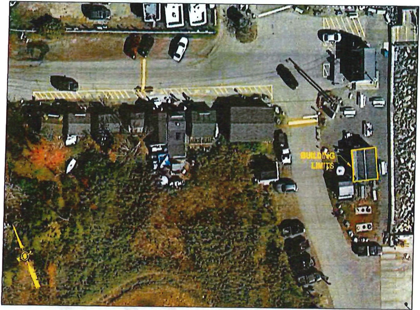
EXHIBIT A - RYE HARBOR RIGHT OF ENTRY

DESIGNED BY: MCR DATE: 05/05/2023 SCALE: N.T.S.